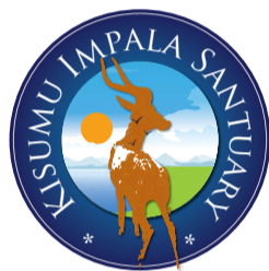
A lakeshore walk with Impalas