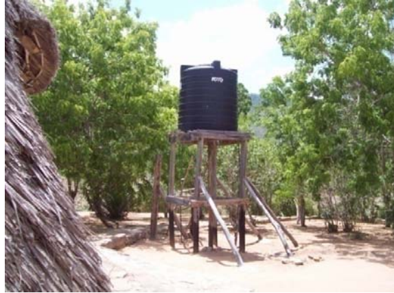
The water tank & surrounding vegetation at the campsite