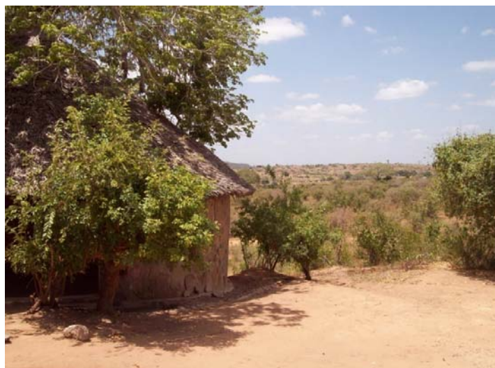
A store at the campsite